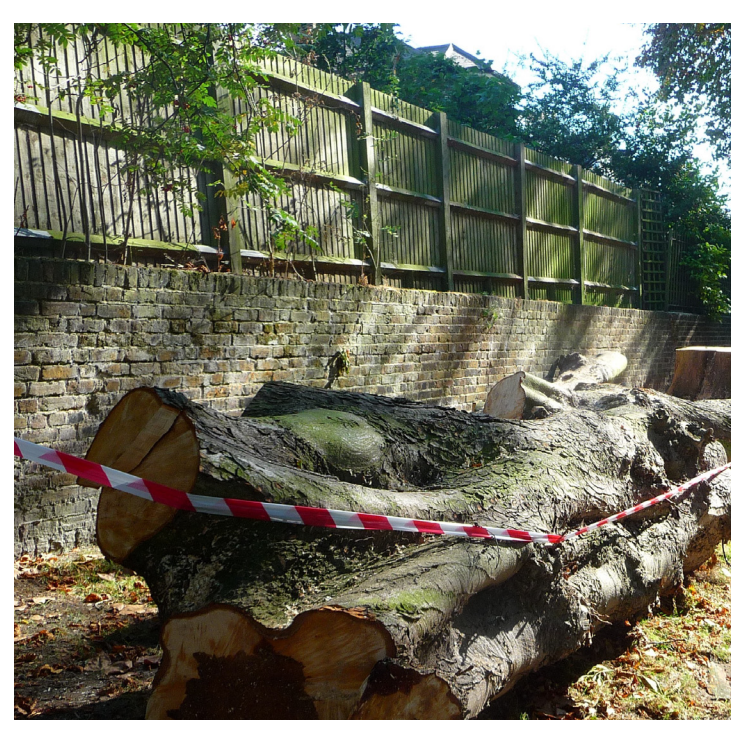
Fallen chestnut near Holland Walk

other parts of the tree unpalatable to nibbling beasties; for example, an oak produces extra tannin. These chemicals cost the tree a great deal of energy to produce and, if they are already weakened by stress, they cannot afford the effort, hence increasingly their vulnerability to attack. They need the health and resource to defend themselves, not least because the defensive chemicals produced warns nearby trees of the same species, and they too produce defensive substances. I did say they were clever.