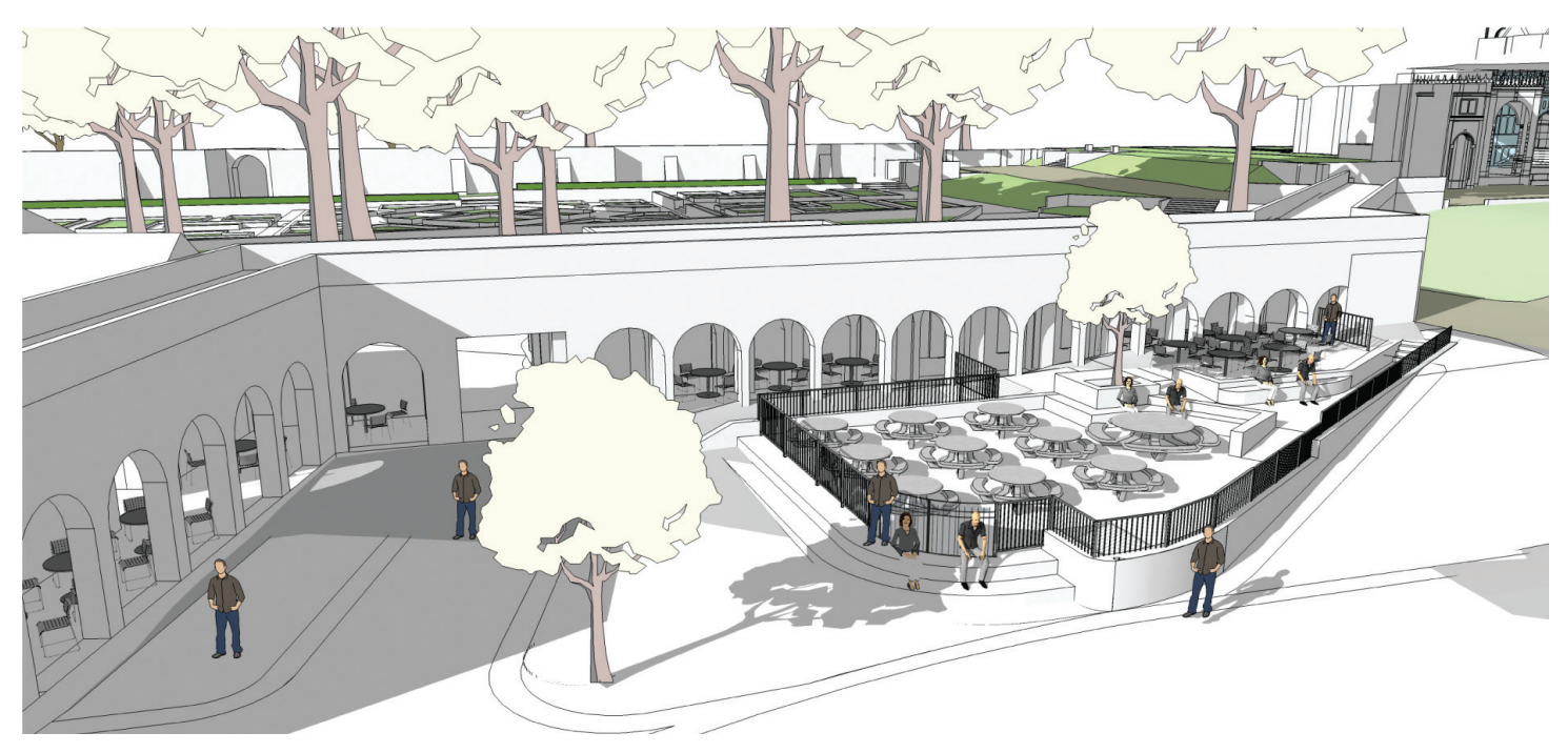
Artist's impression of the proposed café yard