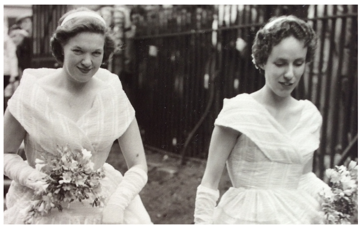
Catherine's bridesmaids, also gardeners in the park

female gardeners, but the London County Council did, and sent her to us. She started as a third-class gardener (not allowed to work alone) and quickly passed a practical exam to become second-class (allowed to work alone or with another secondclass) and then a written exam to become first-class (trusted to work alone or supervise a third-class). The standard of the written exam was very impressive. Questions included 'What