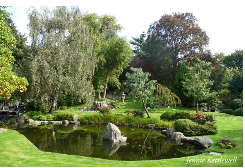
The Kyoto Pond

Now that the gates have been splendidly restored, it is time to improve the area just inside the