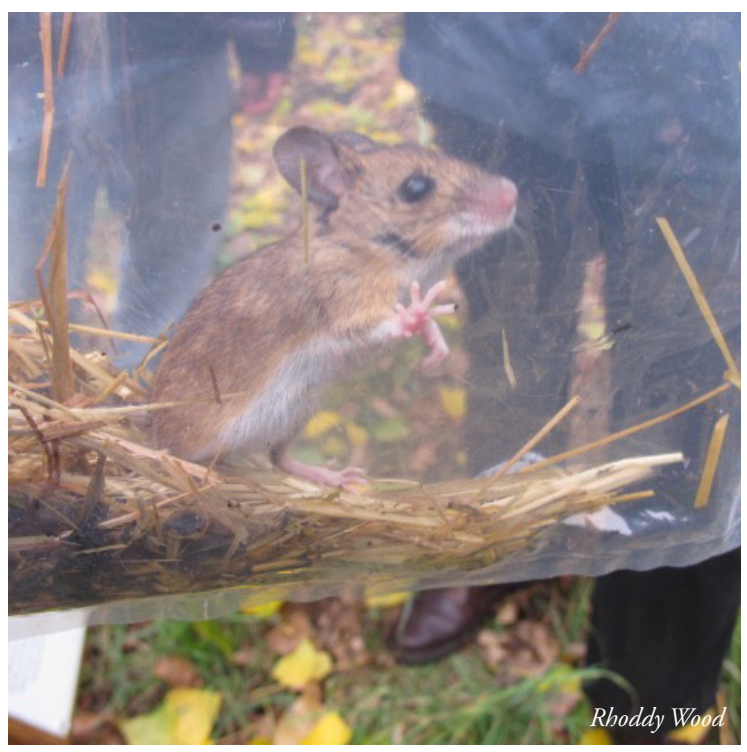
Trapped wood mouse

enough to capture, temporarily, two very lively wood mice. These traps do not harm the animals, as once inside there is food and hay for them to sleep in overnight before being released. The last type of survey method shown was a camera trap, which we have over the last few months put in many different enclosures of the park. It is motion sensitive, taking a photo every time something walks past the light sensor. It has captured a family of fox cubs playing in the wildlife area, at least three rabbits and a very impressive looking dog fox that appears to like to patrol the north part of the park near the D Garden.