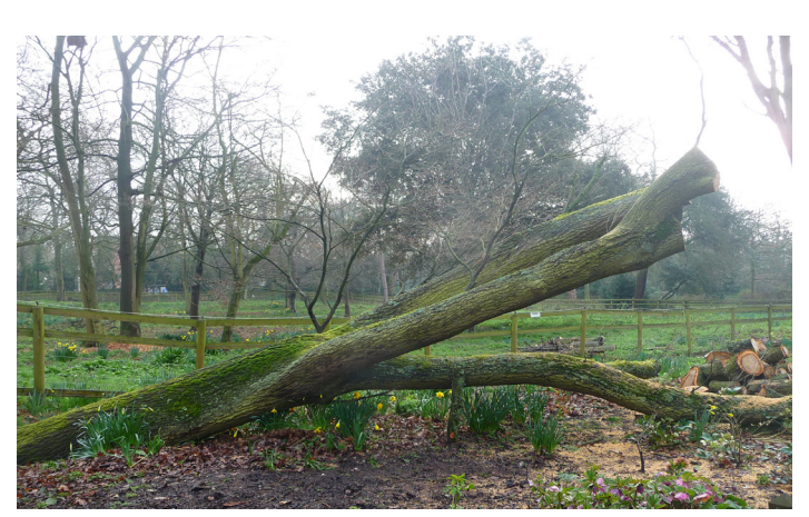
Fallen oak by Acer Walk

Every year, we lose still more trees in Holland Park. Far too many rare trees have gone (Caucasian Wingnut, Chinese Sycopsis, Toothed Azara, Pink Siris, Lebanon Oak, Judas Tree and Chestnut-leaved Oak, to name but a few) and also some significant large trees. Some are old and just give up, and some are defeated by pests and diseases which they are insufficiently vigorous to resist. Whatever the reason, we will leave a legacy of far fewer trees unless we start doing something about it – now.