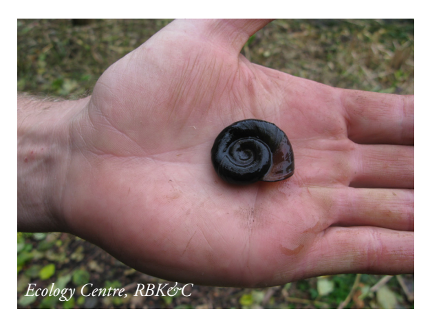
Rescued ramshorn snail

The pond has been drained and all the amphibian life within it (see photos) safely moved to a temporary home. The plan is to reline the pond and replant the margins. The dragonflies and a busy grey wagtail will have left voluntarily before work started. Weather permitting, this work should be completed by the end of 2016, ready for schools visits in 2017.