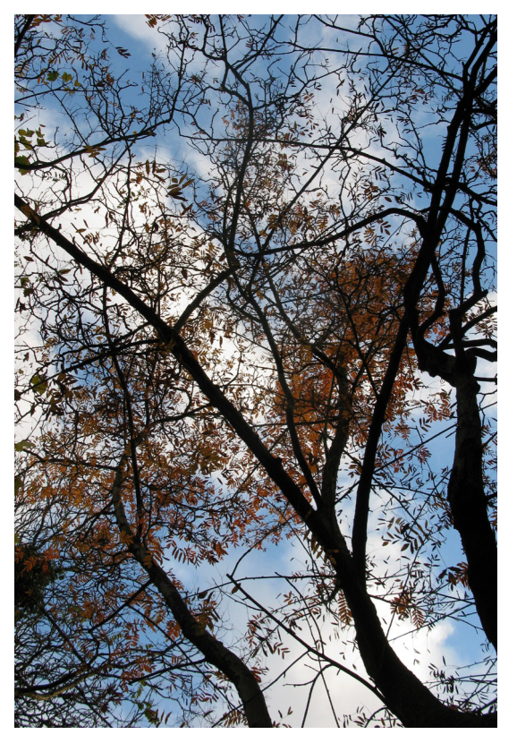
The cover photo, of a Narrow-leaved Ash (Fraxinus angustifolia), was taken by your editor on the north-east side of the park in December 2014.